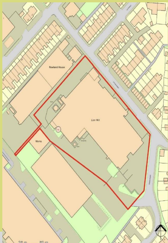
Lion Mill Site